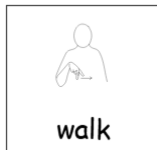
The sign for 'walk'.

Use you hand and 'walk' your fingers forward