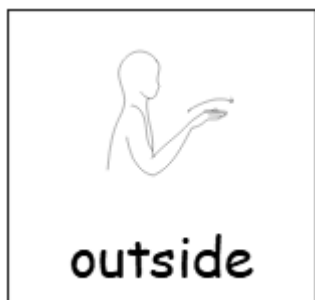
The sign for 'outside' flat hands points away from the body. This is a directional sign so you point to where outside is.