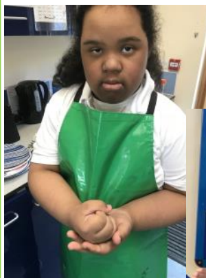
Lenny signing "want"

Some of our pupils are amazing signers and they are great role models for their peers. Jelano signing "help"