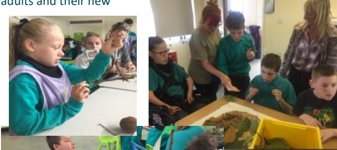
Pupils enjoying their 'Autumn' themed craft integration sessions.

Since joining the Senior Department this term, Senior 1 have loved taking the opportunity to join in with twice weekly Senior Department integration sessions. These afternoons provide a time and space for pupils to develop their friendship skills with both classmates and friends in other classes through art, games and creativity. Communication skills have also progressed as pupils have begun to communicate with less familiar adults and their new